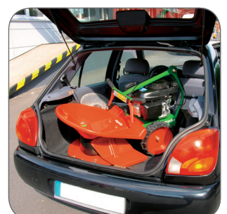
...for easy transport