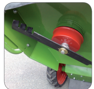
Special cutting blades for best mulching results