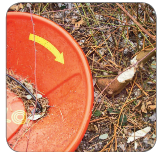
Cuts scrubs and bushes with a diameter of up to 2 cm