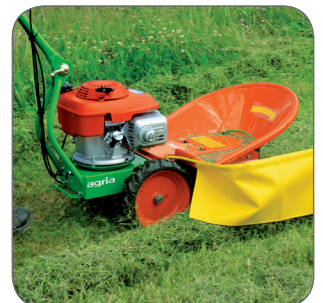
Detachable swath deflector